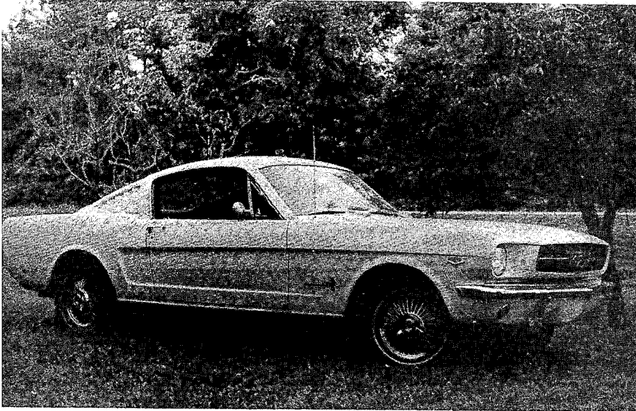
1965 MUSTANG 2+2 FASTBACK