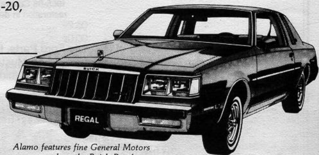
Alamo features fine General Motors cars such as the Buick Regal.

Present this certificate on arrival at the Alamo counter at any Florida location. Reserve 24 hours in advance. Be sure to use your Association I.D. Number and request Plan BY. Call your professional Travel Consultant or Alamo at 800-732-3232.