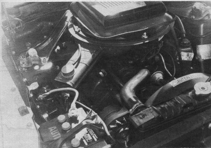
Original 57,000 mile 351 4V Cleveland.