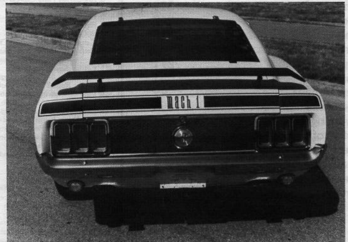
Window slats, rear spoiler and dual exhaust are original equipment.