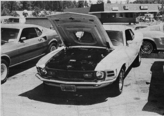
This Mach I was once owned by a "little old lady".