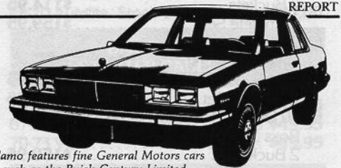
Alamo features fine General Motors cars such as the Buick Century Limited.