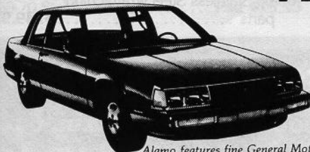
Alamo features fine General Motors cars such as the Buick Park Avenue.