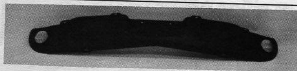
Lower Front Valances (Repro)