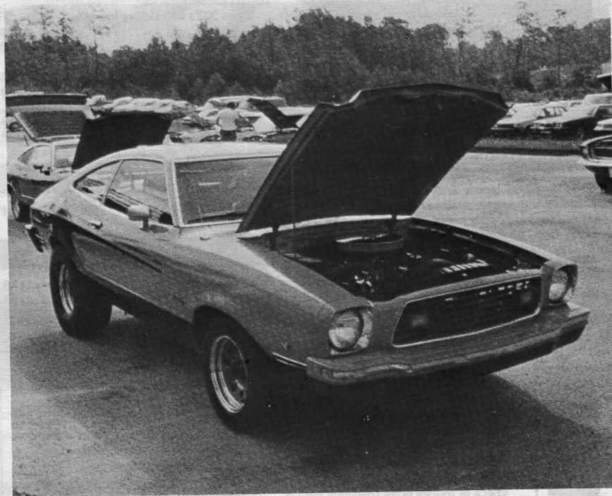
. . . After