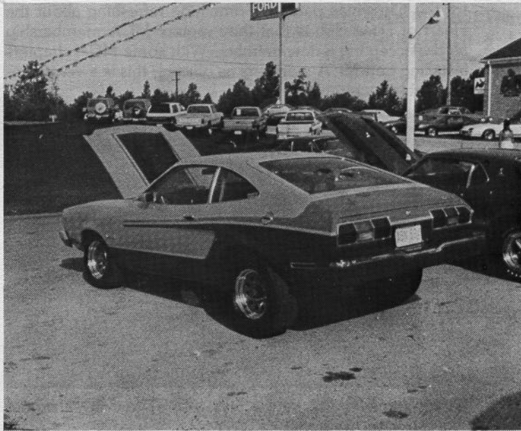
The first showing of this modified 1975 Mustang II.

bright red, and bright blue). A friend of mine in the fire department painted the car for me and I painted the underneath bright blue.