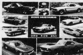
BOSS MUSTANGS 302 - 429 - 351