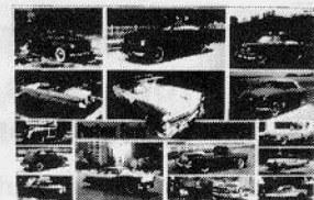
POSTWAR FORDS 1946 - 1959

55, 56, 57, 58 2 DR HARDTOP, 59 CONV, 60 2 DR HARDTOP, 61 2 DR HARDTOP, 62 SPORTS RDS, 63 CONV, 64 CONV, 65 2 DR HARDTOP, 66 CONV