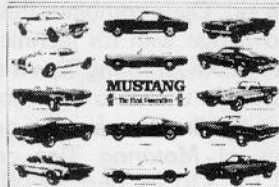
MUSTANG - THE 1ST GENERATION

ADD $2.00 PER ORDER FOR SHIPPING & HANDLING, PA RESIDENTS ADD 6% SALES TAX