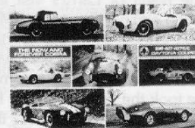
THE NOW AND FOREVER COBRA 289 - 427 - 427 S/C DAYTONA COUPE

65 GT350, 66 GT350, 66 GT350H WITH SUPERCHARGER, 67 GT500, 68 GT350, 68 GT500KR, 60 GT350