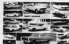
FORD'S SOARING 60'S

46 CAB CONV, 47 MDL 71 SPTMAN CONV, 47 SPR DLX TDR SDN, 48 SPR DLX, 49 CSTM CONV, 52 CRSTLNE CONV, 53 VIC, 54 CRSTLNE CONV, 54 MNE SDN, 55 SNLNER CONV, 55 CRN VIC, 56 CRN VIC, 57 FAIRLANE 500, 58 FAIRLANE 500 SKYLNER CONV, 59 SKYLNER GALAX