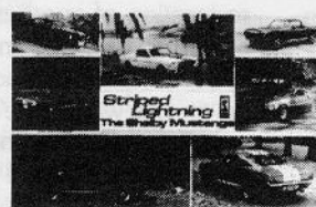
STRIPED LIGHTNING - THE SHELBY MUSTANGS

69 MACH 1 429, 69 BOSS 302, 69 BOSS 429, 70 BOSS 302, 70 BOSS 302, 70 SUPER BOSS 429, 70 BOSS 429, 70 BOSS 302, 71 BOSS 351