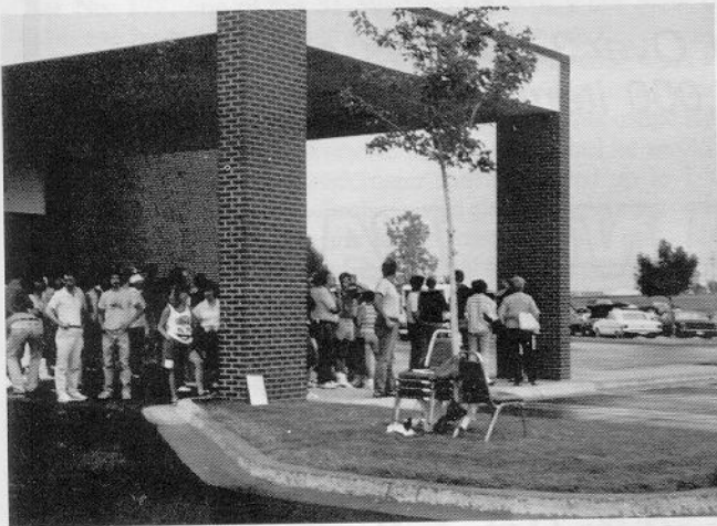
Vintage Show Onlookers Find Some Shelter

But nothing melted, spirits remained high and everyone seemed to enjoy the weekend. The judges are over their colds by now, and we're already talking about next year. Maybe we fooled Mother Nature after all!