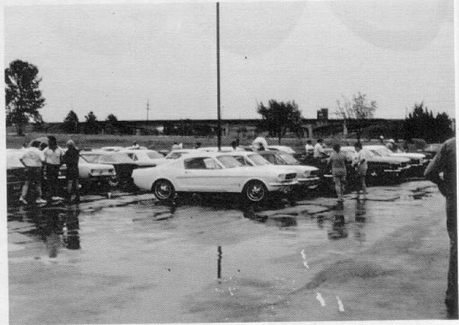
Rain Was Order The Day For Vintage Show

All of which is a tribute to the many Vintage Mustang Club members who help to make our show such a popular event each year. Once again, more than 40 of our members pitched in, in one way or another — this year under particularly trying circumstances.