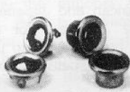
69-73 Door Lock Knob Grommets SLM 101 $2.00 Pair

We Have The Answer For Your Cracked And Torn Deluxe Door Panels. Excellent Quality Reconditioned Panels With Fresh New Vinyl Applied On Your Present Door Panels In All Original Factory Colors, Plus New Carpet. All This For Less Than "Hard Shelled" Skins. When You Receive Your Panels All You Have To Do Is Install Them In Your Mustang.