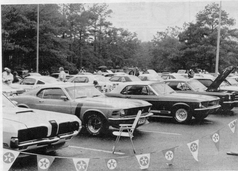
DESPITE SHOWERS, 77 CARS PARTICIPATED IN THE MISSISSIPPI SHOW