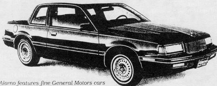
Alamo features fine General Motors cars like this Buick Skylark.