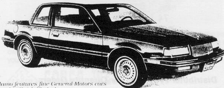
Alamo features fine General Motors cars like this Buick Skylark.