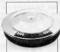
AIR CLEANER ASSEMBLY

Original Type ..... 35.95 Aftermarket ..... 18.95 (both include element/decals)