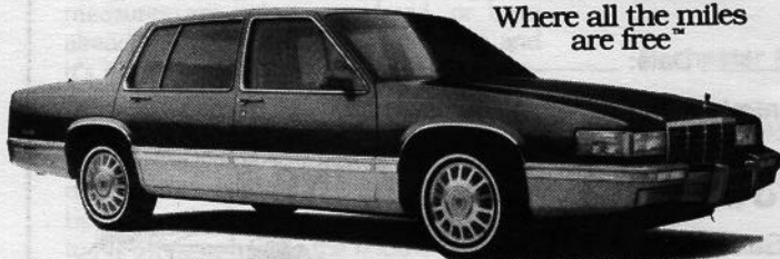
Alamo features fine General Motors cars like this Cadillac Sedan De Ville.