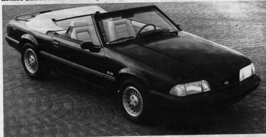
The 1990 Limited Edition Mustang 5.0 LX Is A Beauty, But It's No Anniversary Pony

Ford continued to offer a full range of Mustangs designed to appeal to almost anyone in the market for a sports car. The Mustang GT was aggressive in styling and performance. The Mustang LX 5.0L offered the refinements of a luxury sports car. The LX was offered with a 2.3 liter overhead cam four-cylinder engine and an