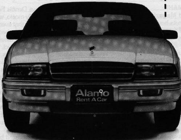
Alamo features fine General Motors cars like this Buick Regal

As a member, you'll receive other valuable coupons throughout the year that will save you money on each rental. You can count on a great deal with Alamo. For member reservations call your Professional Travel Agent or Alamo's Membership line at 1-800-354-2322.