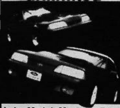
Late Model Mustang Parts

1974-93 Mustang Over 50 pages of restoration and performance parts and accessories for Mustang II to 5.0 EFI. Only $2.00