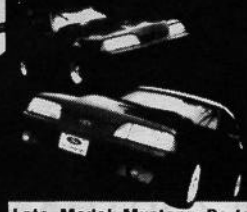
Late Model Mustang Parts

1974-93 Mustang Over 50 pages of restoration and performance parts and accessories for Mustang II to 5.0 EFI. Only $2.00