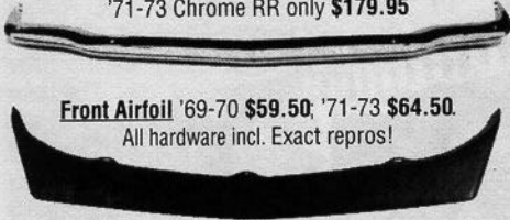
Front Airfoil '69-70 $59.50; '71-73 $64.50. All hardware incl. Exact repros!