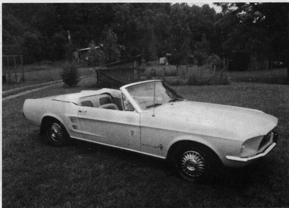
The Mustang Club of America