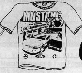
Event T-Shirt (Sizes: SM to XX-LG) $15.00 each