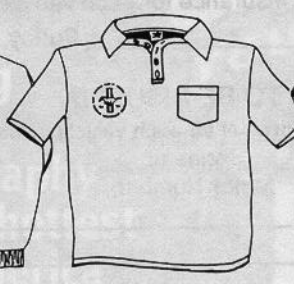
Embroidered Golf Shirt (Sizes: SM to XX-LG) $30.00 each