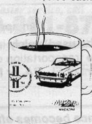
30th Anniversary Mug (White Ceramic) $6.00 each or Set of 4 $20.00