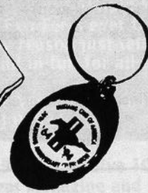
Brass Plated Event Key Ring $5.00 each