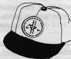
30th Anniversary Hat $12.00 each