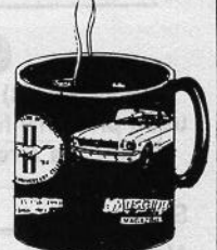
30th Anniversary Mug (Blue/Gold) Individually Numbered $8.00 each

Phone Orders: (404) 482-4822 / FAX (404) 482-8666 / Mail Orders: Mustang Club of America • P.O. Box 447 • Lithonia, GA 30058