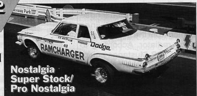
Nostalgia Super Stock/ Pro Nostalgia