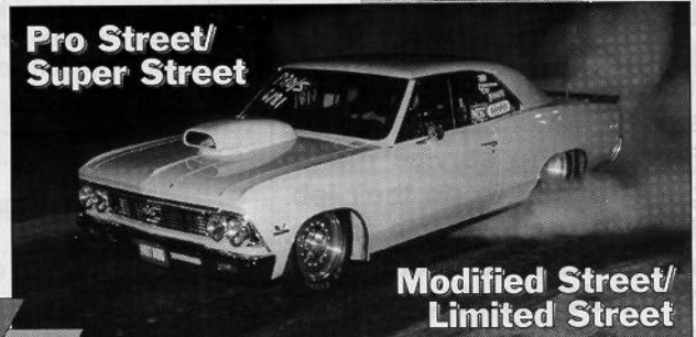
Modified Street/ Limited Street