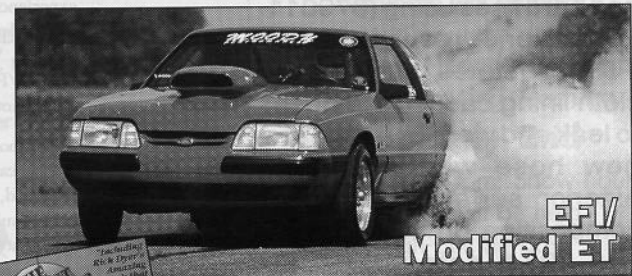
EFV/ Modified ET

Visit Our Sponsors at the MANUFACTURERS MIDWAY