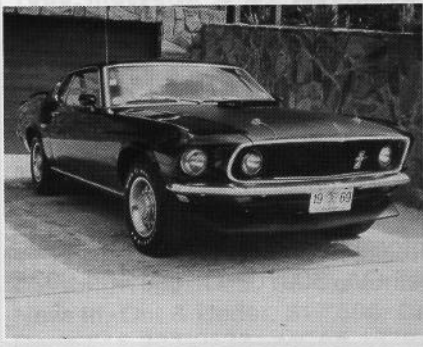
MUSTANG TIMES/MAY, 1995

If you'd like an up-close look at a real survivor of the street racing wars from the late 60's and 70's, feast your eyes on this one the very first chance you get.