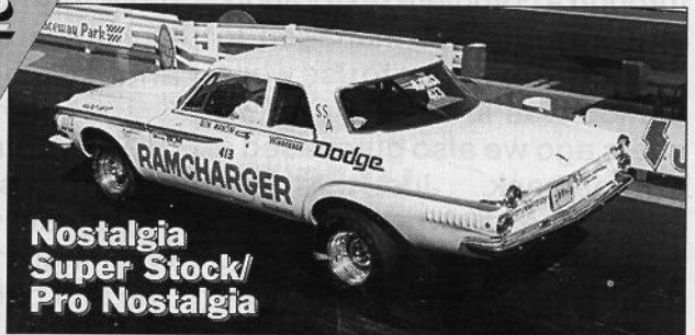
Nostalgia Super Stock/ Pro Nostalgia