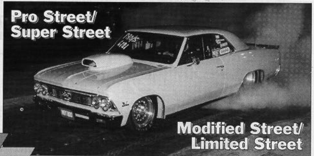
Modified Street/ Limited Street