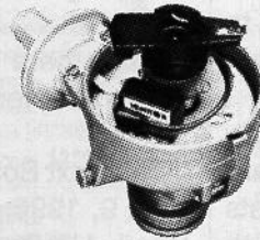
(Distributor not included)