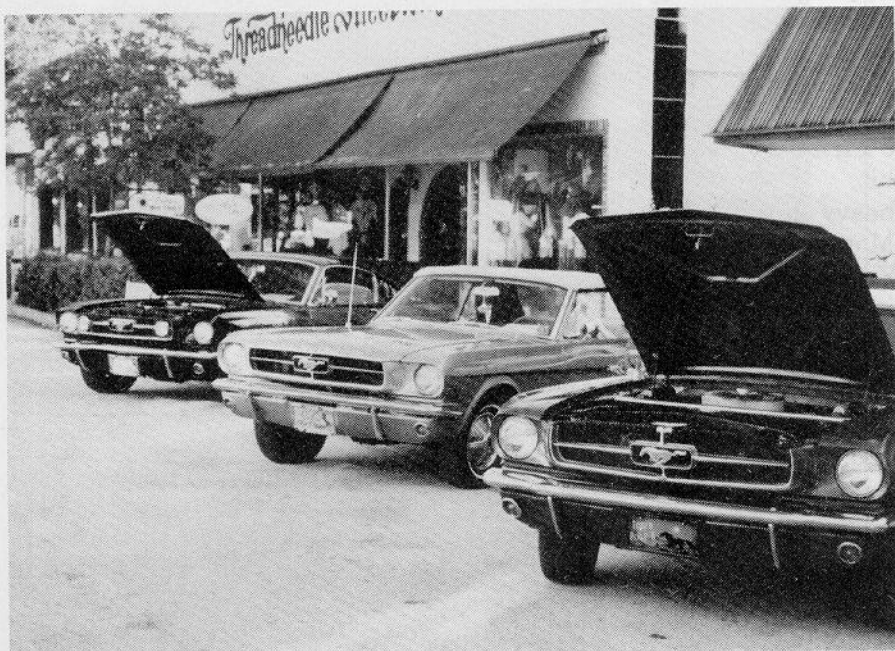
The historic Cocoa Village, located in Cocoa, Florida, was the perfect location to showcase vintage Mustangs for the 14th annual event hosted by the Space Coast Mustang Club.

The Space Coast Mustang Club recently hosted the 14th Annual Cocoa Village Mustang Show held November 3, 1996. Beautiful downtown Cocoa Village, which is an historic area with quaint gift and craft shops, served as the perfect backdrop for vintage to modern Mustang iron. The weather was picture perfect with clear skies and a delightful temperature of 70 degrees. The combination made for an outstanding show.