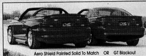
Aero Shield Painted Solid To Match OR GT Blackout

Silver Cobra emblem floats in opening for a striking appearance. Easy to install.