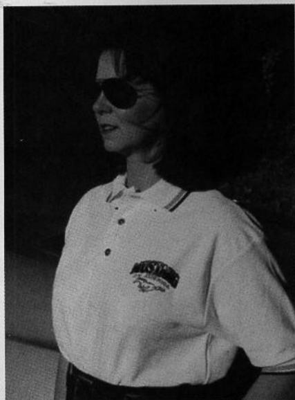
Mustang Club of America Navy Blue Baseball Cap with Mesh Back

Price: $13.00 ea. Quantity requested: _____