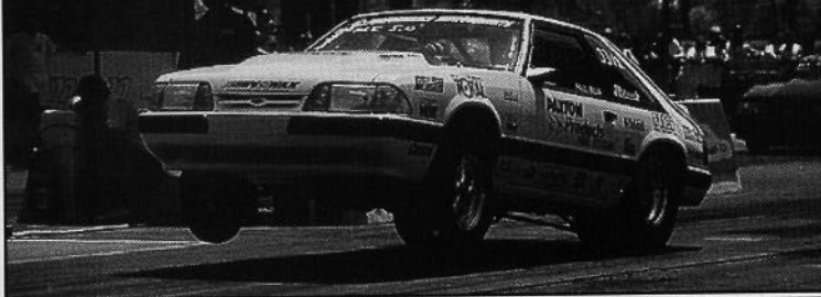
Heads up Racing