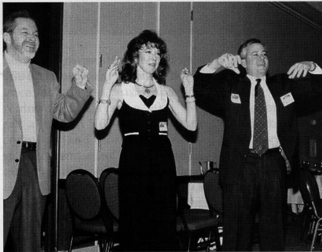
No, this is not a holdup in progress. It's merely another variation on the Mustang Dance theme.

the evening and dancing is encouraged. In fact, sometimes it is demanded.