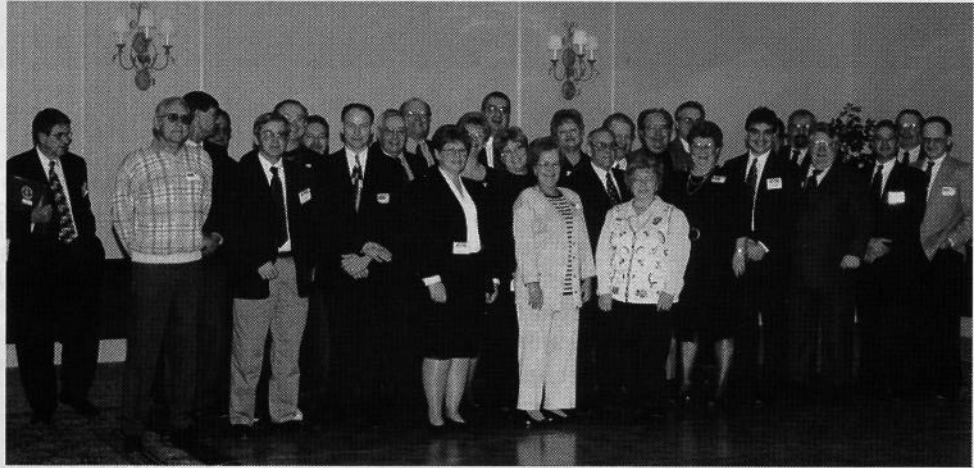
Your 1998 Mustang Club of America officers and Board of Directors.

Each year the Mustang Club of America installs new members to the Board of Directors. Officers are installed every other year. Always held the third or fourth weekend in January, a dinner is held in the Atlanta area to officially welcome the newest members of the gang that oversees the running of this international organization.