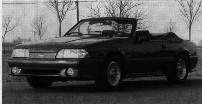
1990 GT convertible owned by Bill & Lois Rettig.

driver's side foot rest. Map pockets were added to the door panels and the center console/arm rest was deleted. Three new interior colors were