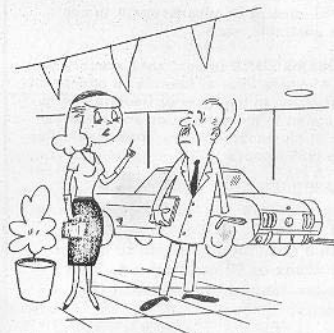
"Oh, yes... I want the license plates painted to match."