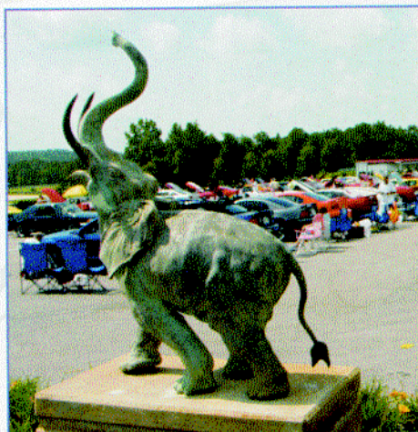
With various statues and castings of animals, insects, and flowers displayed all around Barber, the outstanding landscaping is something you won't see at many race tracks around the USA.