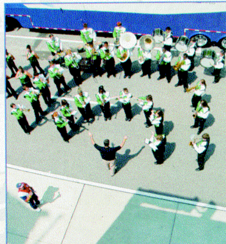
The Leeds High School marching band played the National Anthem, and then the festivities began.