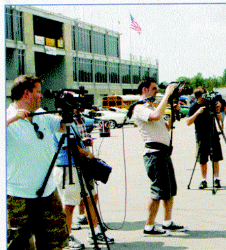
The History Channel was on site for three days filming a special on the 1960s which will include the Mustang.