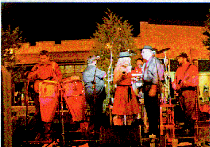
The Flashbacks entertained the crowds late into the evening. It's hard to imagine that anyone who was a part of this party not having a good time during this fun-filled evening.