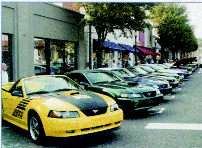
What a beautiful sight, Mustangs lined all the downtown streets of Homewood.