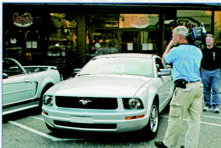
One of the news anchors of Channel 13, the local NBC affiliate, recently bought this new Mustang. Of course, his camera crew was sure to capture the car on tape for the 10:00 nightly news.