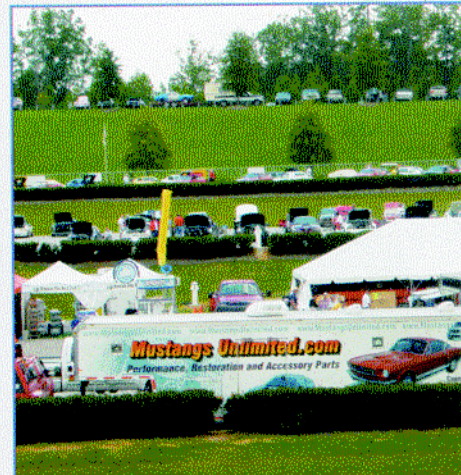
Standing on the roof of the timing building gave this wonderful view of the beautiful, tiered show field. There actually was one more lower tier not shown in this photo.