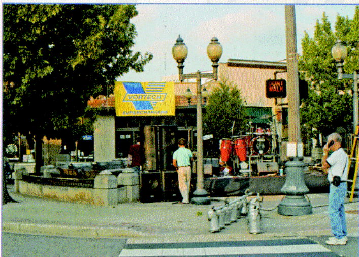
Preparations were underway in Homewood for the soon-to-arrive Mustang caravan. This area will be the stage for the band, The Flashbacks.