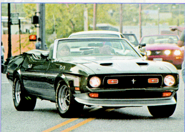
Members of the Magic City Mustang Club parked many gorgeous Mustangs along the downtown streets.