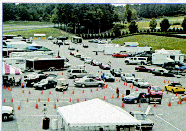
The view from the roof of the false grid as one of the groups of Mustangs prepare to go out onto the track.