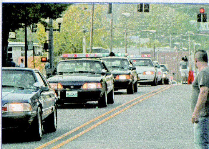
The caravan begins to arrive in town led by several Special Service Mustangs, sirens sounding, lights flashing. It was quite a site!