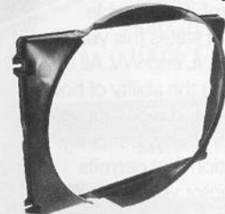
1967-70 Mustang radiator shrouds made from original Ford tooling

FOR A LISTING OF ORIGINAL FORD TOOLING PARTS VISIT