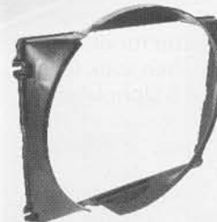
1967-70 Mustang radiator shrouds made from original Ford tooling

FOR A LISTING OF ORIGINAL FORD TOOLING PARTS VISIT