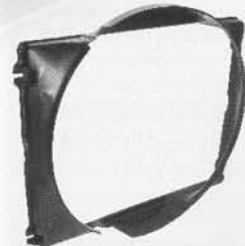
1967-70 Mustang radiator shrouds made from original Ford tooling

FOR A LISTING OF ORIGINAL FORD TOOLING PARTS VISIT