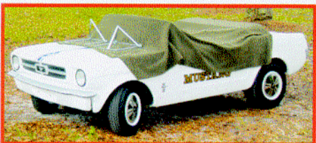
Junior even got covered up when the rains came on Saturday afternoon.