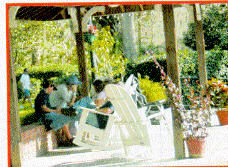
If you get tired, or just want to sit and rest a bit, there are plenty of comfortable chairs on the docks of the riverbanks.