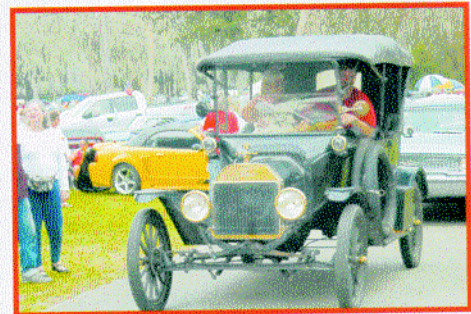
Before you think I lost my mind, I know it's also not a Mustang. It's a 1915 Ford!