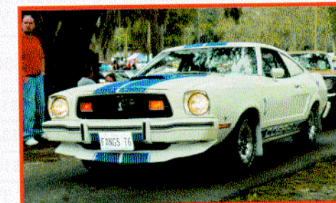
This Cobra II is in awesome condition. What show would be complete without a few Mustang IIs?