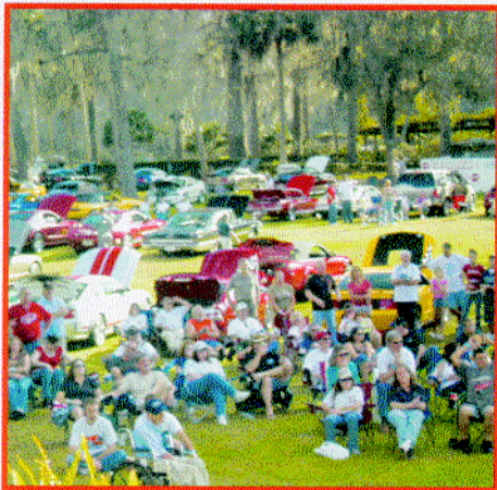
The crowd gathered at the base of the stage for the awards ceremony on Sunday afternoon.