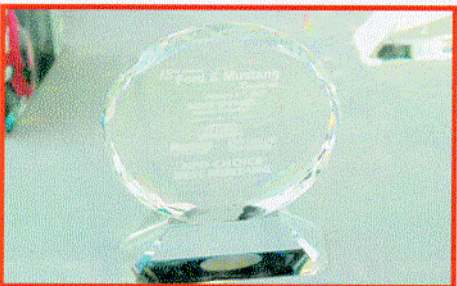
The Best Mustang award to be presented by NPD.