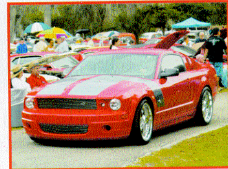
This Foose Mustang captured much attention.