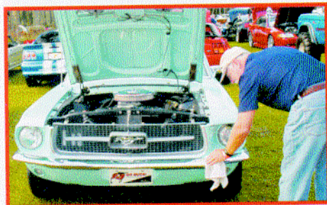
Nearly everyone was wiping down their car first thing each morning.