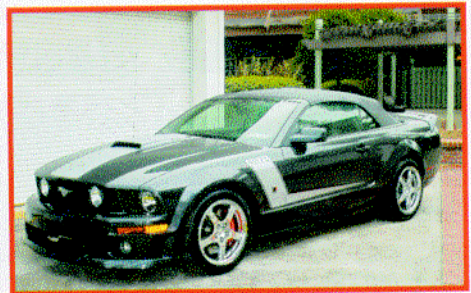
Couldn't believe we saw three Roush 427R's; this one's a convertible.