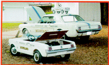
Three different scales of Indy Pace Car Mustangs, pedal, Junior, and the real McCoy!