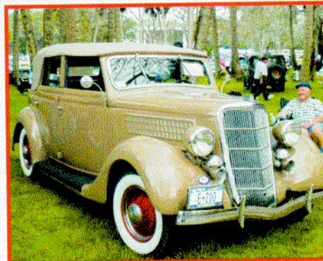
OK, I know it's not a Mustang, but it is beautiful.