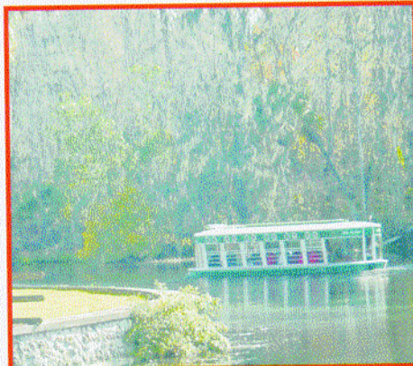
Silver Springs' famous glass-bottom boats traverse on the Silver River giving riders the opportunity to see the underwater springs and wildlife.