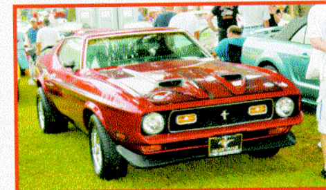
Not your typical 1971 Mach 1, neat paint job!