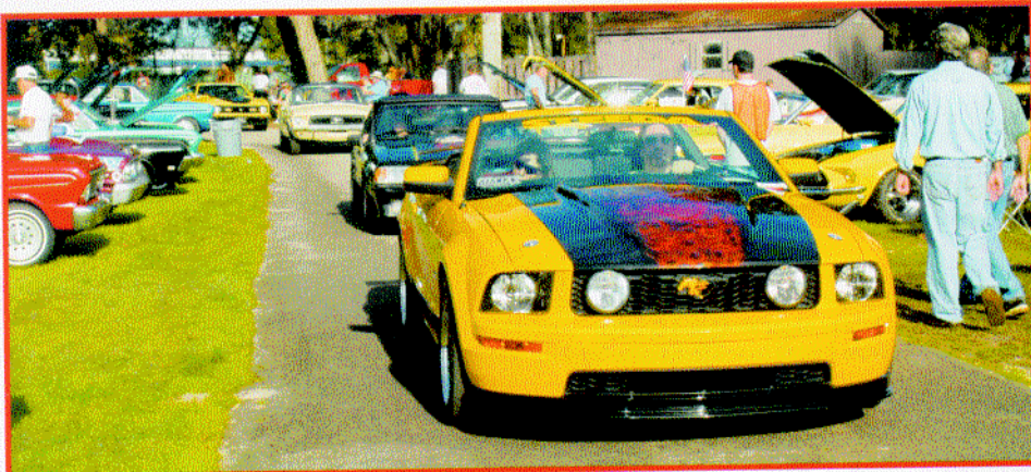
Watching the cars drive in from registration gave us a good view of most of the entrants.