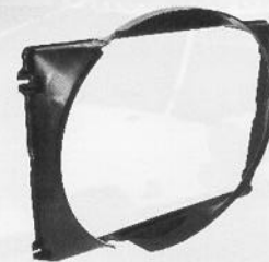
1967-70 Mustang radiator shrouds made from original Ford tooling

FOR A LISTING OF ORIGINAL FORD TOOLING PARTS VISIT