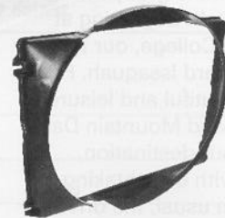
1967-70 Mustang radiator shrouds made from original Ford tooling

FOR A LISTING OF ORIGINAL FORD TOOLING PARTS VISIT