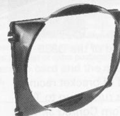
1967-70 Mustang radiator shrouds made from original Ford tooling

FOR A LISTING OF ORIGINAL FORD TOOLING PARTS VISIT