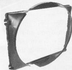
1967-70 Mustang radiator shrouds made from original Ford tooling

FOR A LISTING OF ORIGINAL FORD TOOLING PARTS VISIT