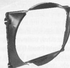
1967-70 Mustang radiator shrouds made from original Ford tooling

FOR A LISTING OF ORIGINAL FORD TOOLING PARTS VISIT