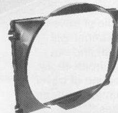
1967-70 Mustang radiator shrouds made from original Ford tooling

FOR A LISTING OF ORIGINAL FORD TOOLING PARTS VISIT