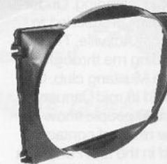
1967-70 Mustang radiator shrouds made from original Ford tooling

FOR A LISTING OF ORIGINAL FORD TOOLING PARTS VISIT