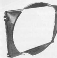
1967-70 Mustang radiator shrouds made from original Ford tooling

FOR A LISTING OF ORIGINAL FORD TOOLING PARTS VISIT