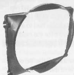
1967-70 Mustang radiator shrouds made from original Ford tooling

FOR A LISTING OF ORIGINAL FORD TOOLING PARTS VISIT