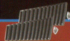
1967-68 Fastback Quarter Vent Assembly