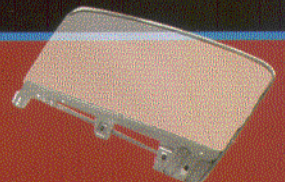
1967-68 Fastback Door Glass Kit, LH