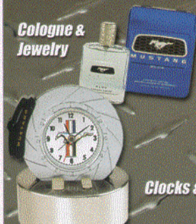
Cologne & Jewelry

Shop the largest selection of Mustang Enthusiast Gifts