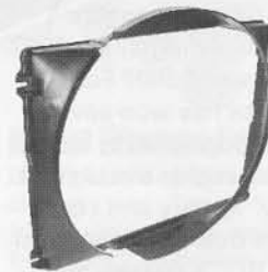
1967-70 Mustang radiator shrouds made from original Ford tooling

FOR A LISTING OF ORIGINAL FORD TOOLING PARTS VISIT