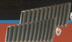
1967-68 Fastback Quarter Vent Assembly