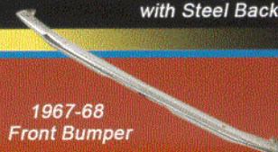
1967-68 Front Bumper